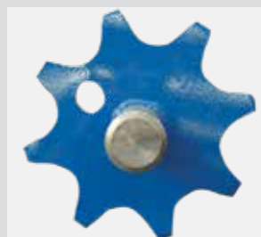
8 tooth sprocket for extended chain life