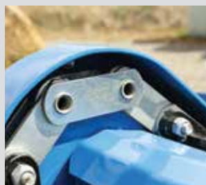
Heavy-duty 3" 12,000 lb roller chain