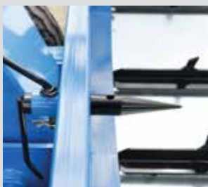
McIntosh aggression pins