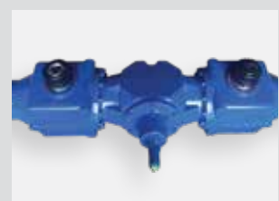
Heavy-duty German one-piece gearbox