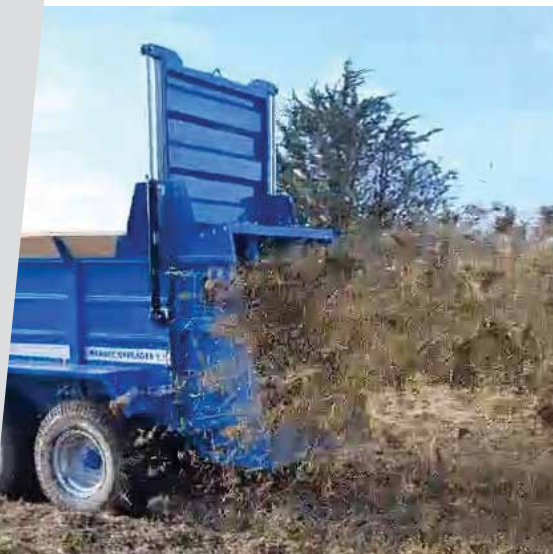
Organic vegetable bed preparation

NB: All weights and measurements are approximate and dependent on specifications and may change without notice.