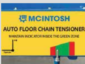
Auto floor chain tensioner with grease gun and holder