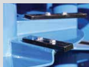
Bolt-on reversible auger tips