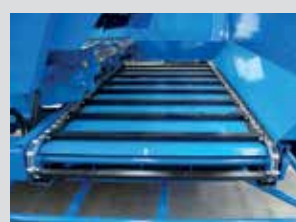
Roller chain cross conveyor (optional)