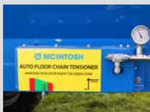
Auto floor chain tensioner with grease gun and holder (optional)