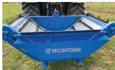
Back panel waste basket