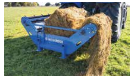
Feeds out either side