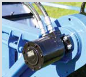
3000 PSI motor with 1 1/4" shaft and large key