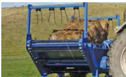
Square bale attachment