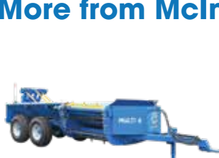
MULTI BALE FEEDER