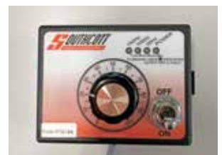
Electric floor speed control