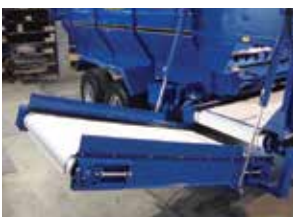
Pivoting cross conveyor with tracking strip (optional)