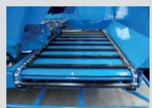
Roller chain cross conveyor (optional)