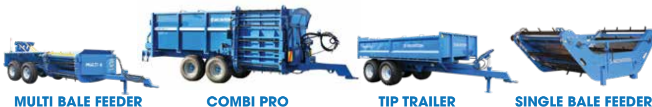
MULTI BALE FEEDER