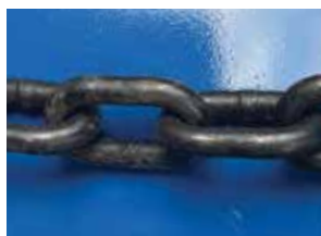
TITAN: 13 mm with 23-tonne breaking strain