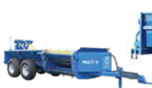
MULTI BALE FEEDER