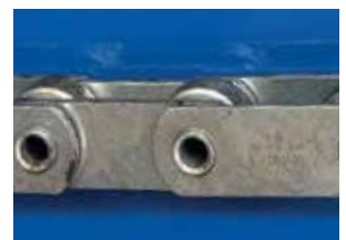
3" hollow pin with 7-tonne breaking strain