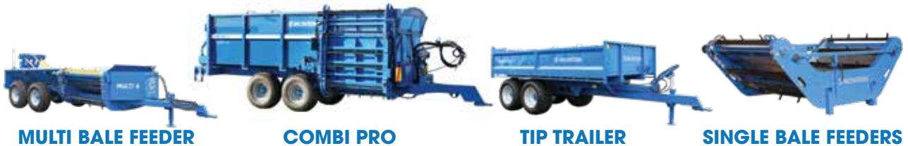
MULTI BALE FEEDER