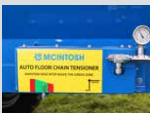
Auto floor chain tensioner