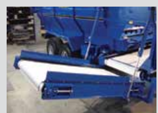
Pivoting cross conveyor with tracking strip (optional)