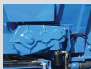
40-1 German reduction gearbox