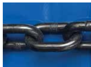
TITAN MAX: 16 mm with 32-tonne breaking strain